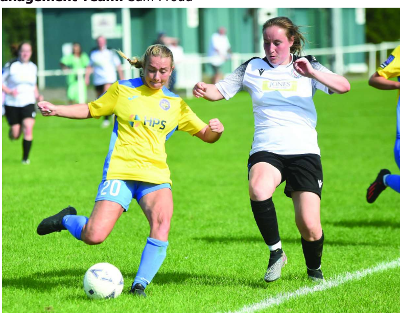
Abingdon on the attack against Portishead earlier in the season